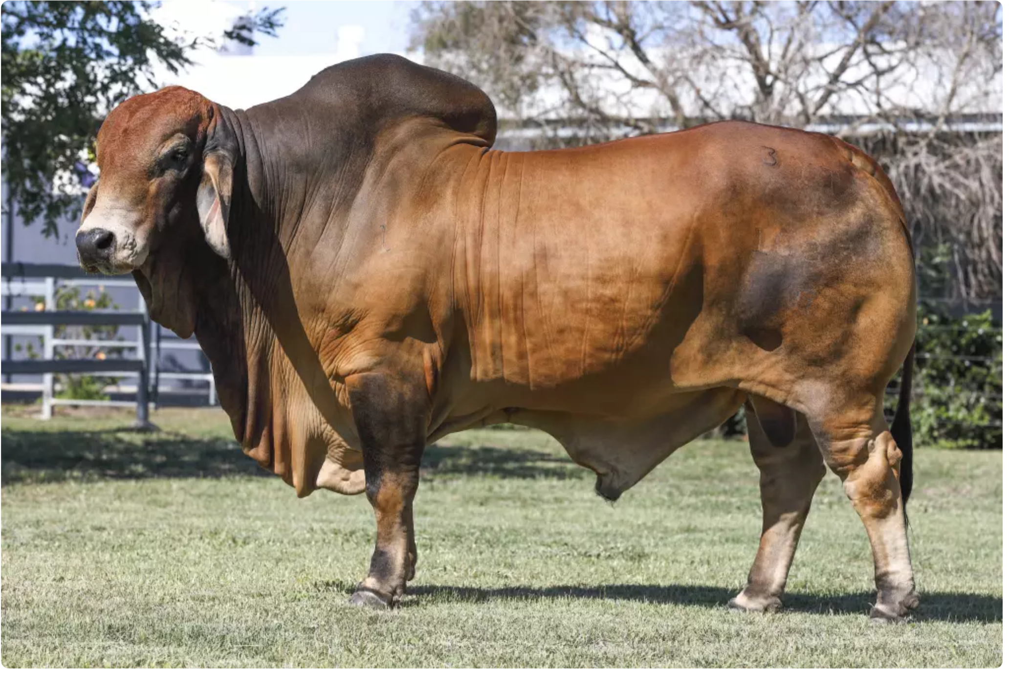
📷 Semen straws from the homozygous polled red Brahman sire Elmo Picasso topped the genetic auction at $5250/straw to return $26,250.

The first GDL In the Tank Genetics Sale held on Stocklive, last Thursday and Friday, proved a hit, with many stud breeders securing 'once in a lifetime opportunity' genetics.